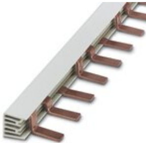
Insertion bridge, pitch: 18 mm, number of positions: 56, color: gray

Please be informed that the data shown in this PDF Document is generated from our Online Catalog. Please find the complete data in the user's documentation. Our General Terms of Use for Downloads are valid ( http://phoenixcontact.com/download )